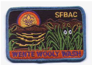
Patch is available for sale in the Tradin' Post

MILE SWIM, BSA: Scouts need to be in good physical shape to live up to the rigorous requirements of this activity. Before swimming the mile, all participants must swim the quarter and half mile. Each swimmer must bring a rower and spotter to accompany them.